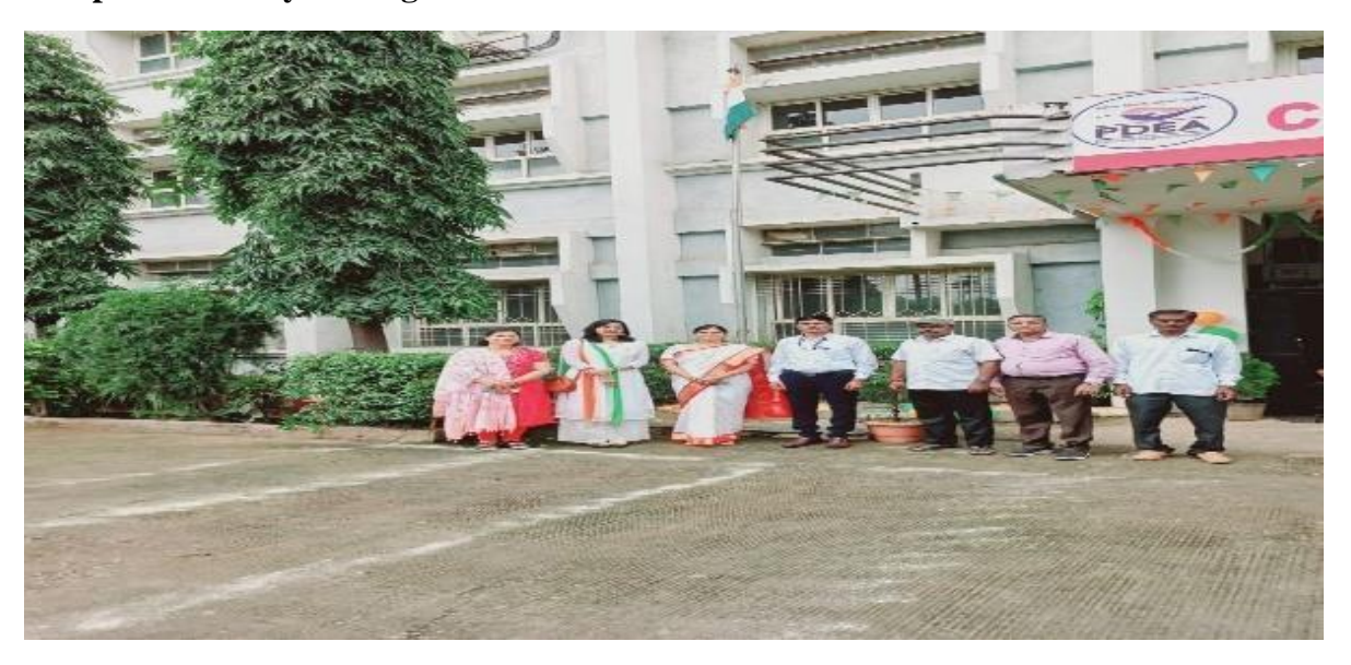
National Sports Day:29 August