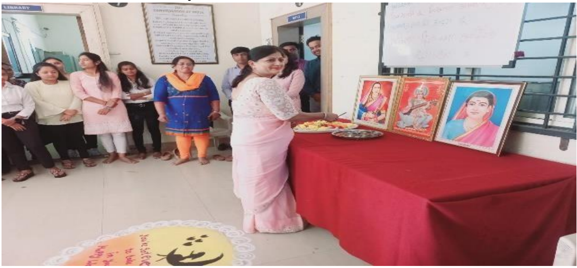
World Environment Day: 05 June