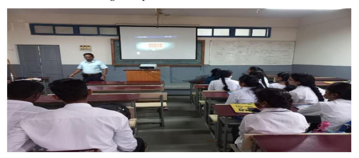
Republic Day 26 January